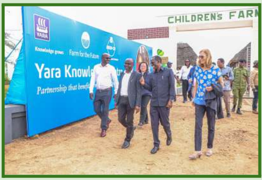
LAUNCHING EVENT IN PHOTOS